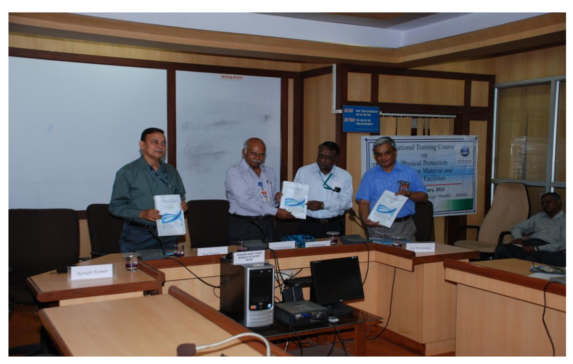
Unveiling of course material