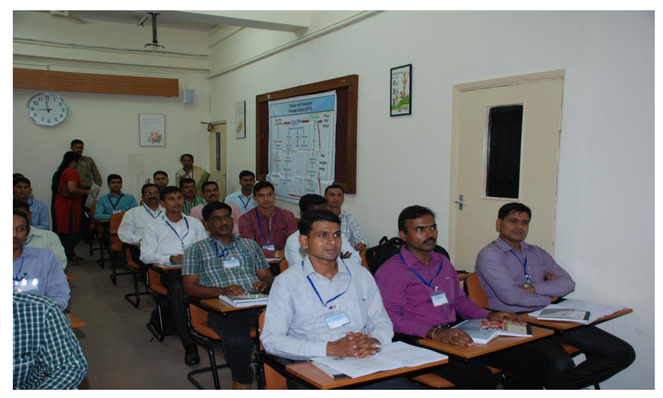
Participants attending course in Lecture hall